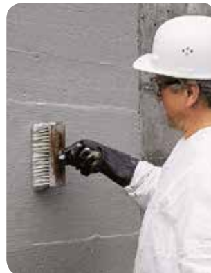
Architectural Wall Coatings