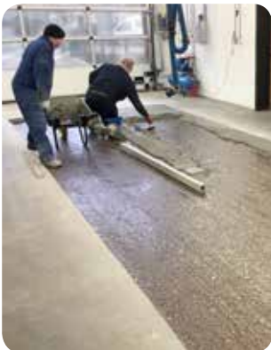
Concrete Repair Materials